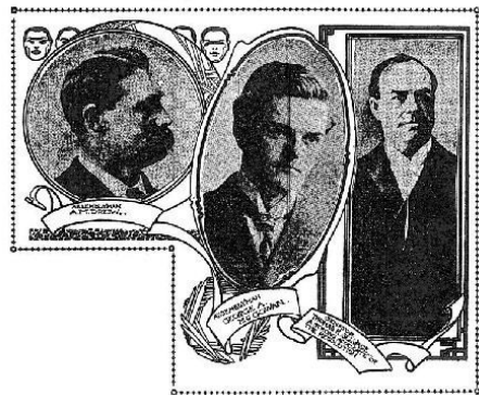
Headline from the San Francisco Chronicle on March 3, 1905.

While many of the 19th century Japanese visitors to the U.S. were sojourners seeking adventure, education, and even economic opportunities, little did they anticipate that if they decided to stay permanently in this country, any move towards naturalization would be barred by an Act of Congress passed in 1790, which allowed only 'free white men' to be naturalized (Chuman, 1976). The Chinese Exclusion Act of 1882 aided (by favoring) Japanese immigration to America, but not for long (Takaki, 1989). In early 20th Century, California passed its Alien Land Law (1913), which used the indefinite alien status of Japanese and other Asians to prevent them from acquiring real estate, and setting down permanent roots. The California law was soon mimicked by other western states (Chuman, 1976). Japanese and other Asian immigration was finally turned off by the passage of the U.S. Immigration Exclusion Act of 1924. Japanese immigration was halted until the 1952 passage of the McCarran-Walter Act. This historic act allowed Issei (Japanese immigrants) to become naturalized for the first time and allowed immigration to resume (at 185 Japanese persons per year), now without constraints to a person's country of origin (Maki, Kitano, & Berthold, 1999).