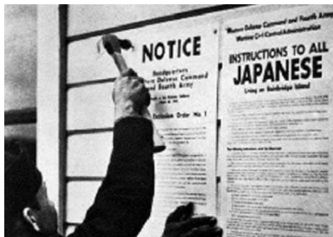
Soldiers and police posted President Roosevelt's February 19, 1942 Executive Order #9066 requiring the expulsion of Japanese Americans from the West Coast. Posters included euphemisms like "evacuation" and "Assembly Centers".