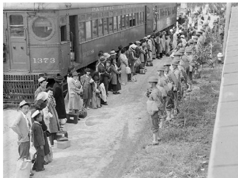
Japanese Americans from San Pedro, California, guarded by soldiers arrive at Santa Anita Race-track, a temporary detention center, in Arcadia, California, in 1942.

Definitions —a euphemism is “a mild word or expression substituted for one considered blunt and embarrassing” (Chantrell, 2002, p.186). It comes from the Greek euphemismos, from euphemizein ‘use auspicious words’. The formative elements are eu “well” and pHEME “speaking” (English usage since late 16th century) (Chantrell, 2002). In more modern times, author William Safire (1981) writes: “To some degree, euphemism is a strategic misrepresentation” (p. 82).